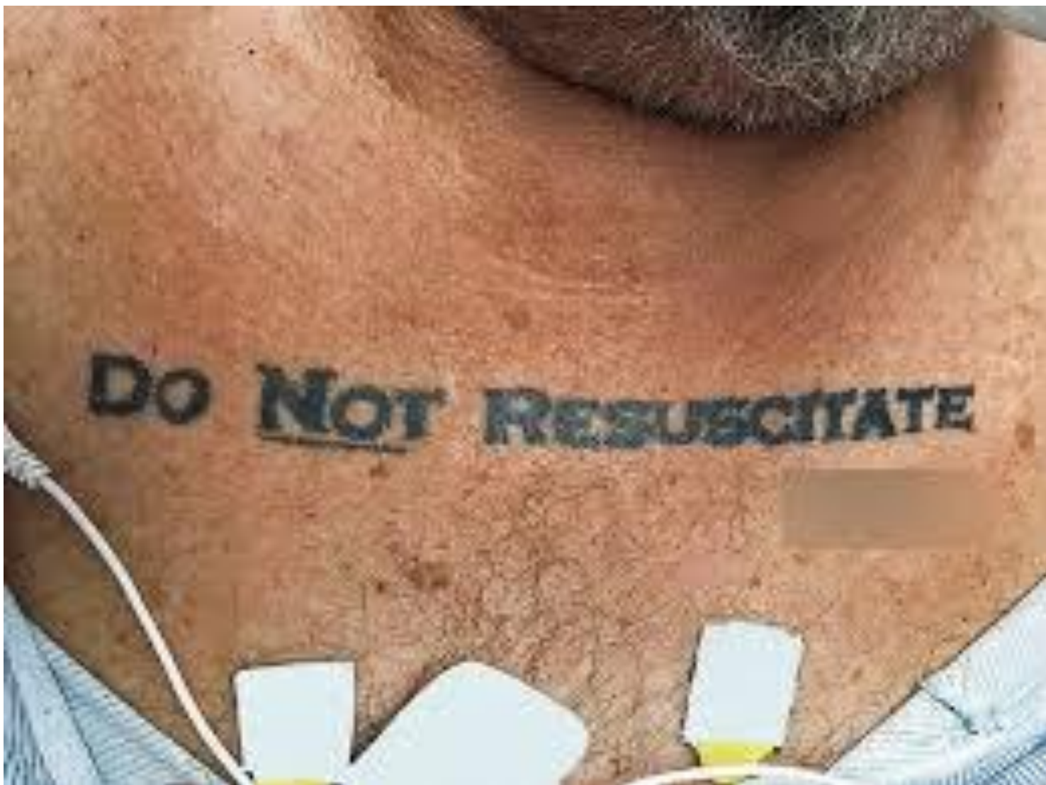
دوره مقدماتی مراقبتهای تسکینی در بیماریهای سخت درمان - زمستان ۱۳۹۸